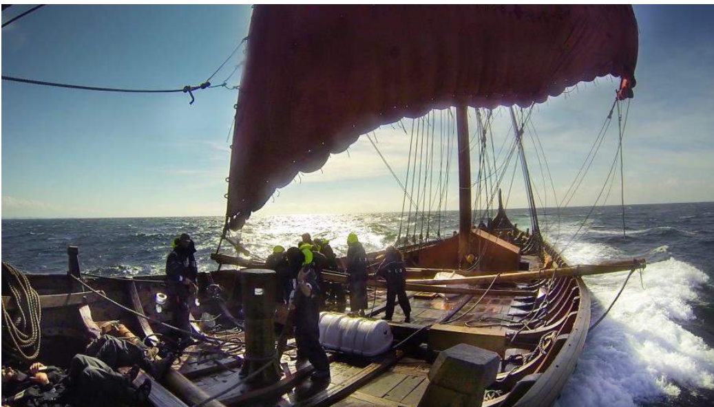
Draken Harald Hårfagre

For more see: http://www.drakenexpeditionamerica.com